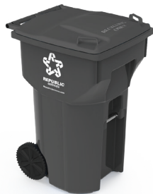
65-gallon equal to 2 trash cans