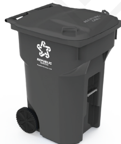
95-gallon equal to 3 trash cans