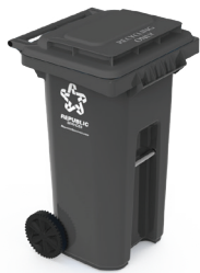
48-gallon equal to 1 1/2 trash cans