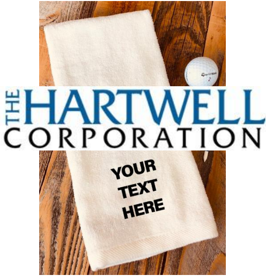
Cooling Towel Sponsor